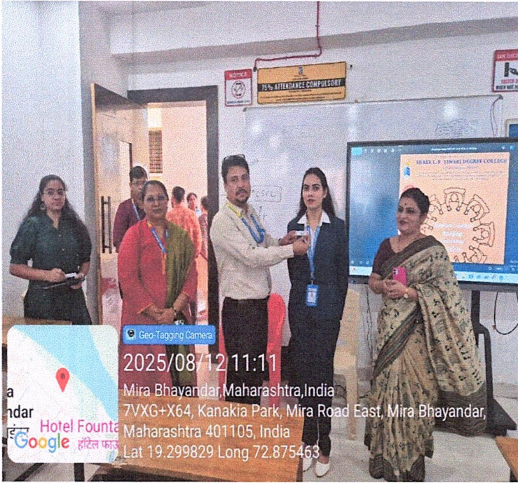
Geo-Tagging Camera 2025/08/12 11:11 Mira Bhayandar, Maharashtra, India 7VXG+X64, Kanakia Park, Mira Road East, Mira Bhayandar, Maharashtra 401105, India Lat 19.299829 Long 72.875463