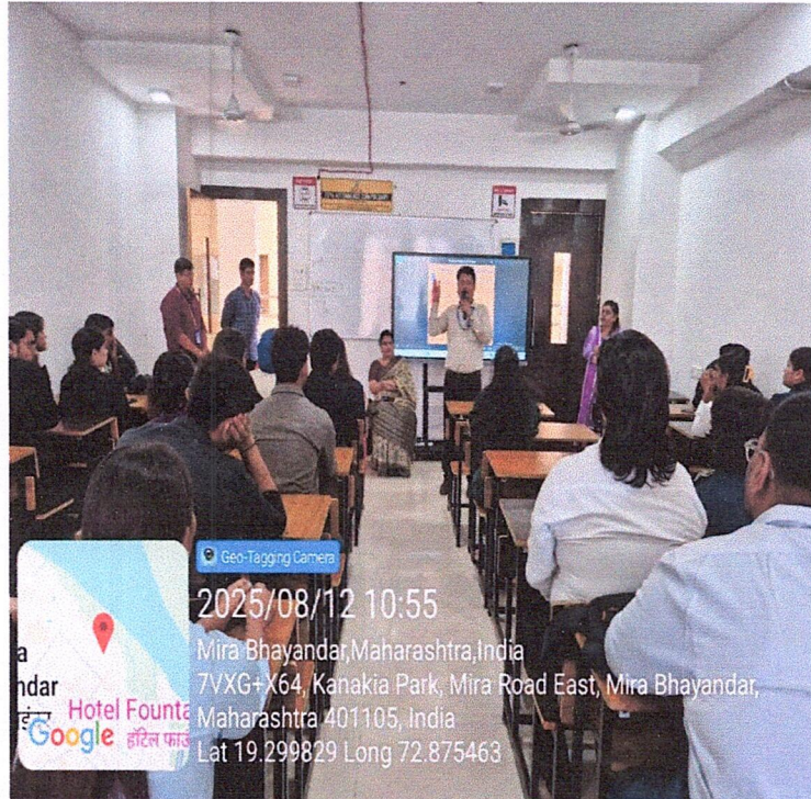
Geo-Tagging Camera 2025/08/12 10:55 Mira Bhayandar, Maharashtra, India 7VXG+X64, Kanakia Park, Mira Road East, Mira Bhayandar, Maharashtra 401105, India Lat 19.299829 Long 72.875463