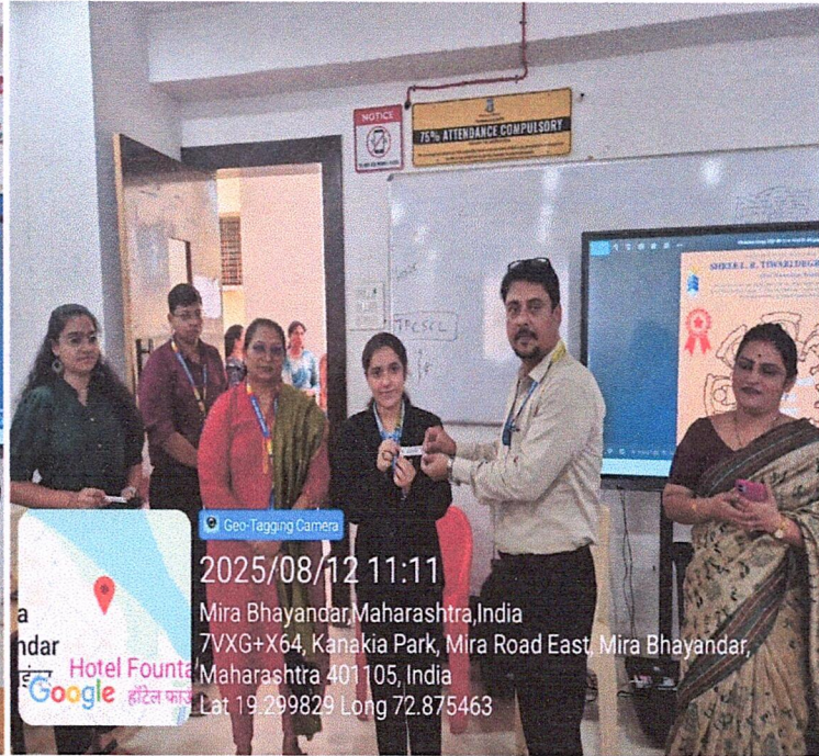
Geo-Tagging Camera 2025/08/12 11:11 Mira Bhayandar, Maharashtra, India 7VXG+X64, Kanakia Park, Mira Road East, Mira Bhayandar, Maharashtra 401105, India Lat 19.299829 Long 72.875463