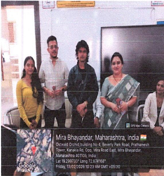
Mira Bhayandar, Maharashtra, India Ostwald Orchid building No 4, Beverly Park Road, Prathamesh Tower, Kanakia Rd, Opp, Mira Road East, Mira Bhayandar, Maharashtra 401105, India Lat 19.299733° Long 72.874168° Friday, 13/02/2026 10:23 AM GMT +05:30