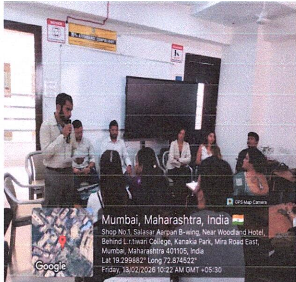
Mumbai, Maharashtra, India Shop No.1, Salasar Aarpan B-wing, Near Woodland Hotel, Behind L.r.tiwari College, Kanakia Park, Mira Road East, Mumbai, Maharashtra 401105, India Lat 19.299882° Long 72.874522° Friday, 13/02/2026 10:22 AM GMT +05:30