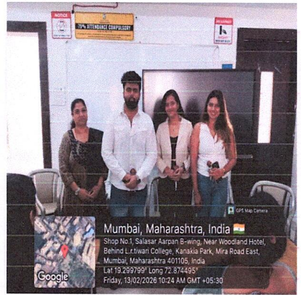
Mumbai, Maharashtra, India Shop No.1, Salasar Aarpan B-wing, Near Woodland Hotel, Behind L.r.tiwari College, Kanakia Park, Mira Road East, Mumbai, Maharashtra 401105, India Lat 19.299799° Long 72.874495° Friday, 13/02/2026 10:24 AM GMT +05:30