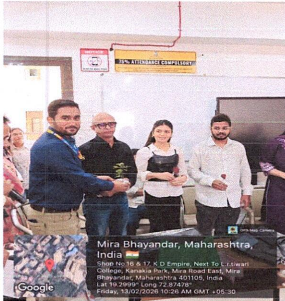
Mira Bhayandar, Maharashtra, India Shop No.16 & 17, K.D Empire, Next To L.r.tiwari College, Kanakia Park, Mira Road East, Mira Bhayandar, Maharashtra 401105, India Lat 19.2999° Long 72.87478° Friday, 13/02/2026 10:26 AM GMT +05:30